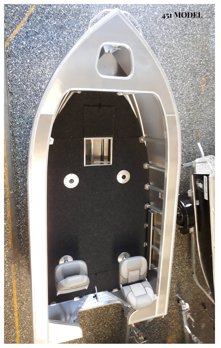
Summit Marine www.summitmarine.com.au

*481 max HP 75 with fuel height motor well and console option *521 max HP 90 with fuel height motor well and console option