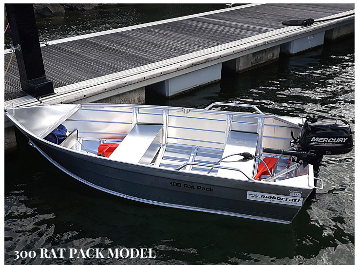
300 RAT PACK MODEL